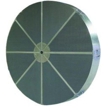
PATENTED Desiccant Rotor Product NOT classified as harmful to the environment

Available with Tailor Made Engineered Dehumidifiers along with the options including but not limited to